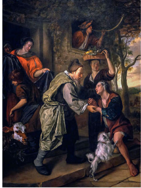
I.35: Jan Steen, “The return of the lost Son”, after 1667. Haag (Netherlands), Mauritshuis (special exhibition 2018).