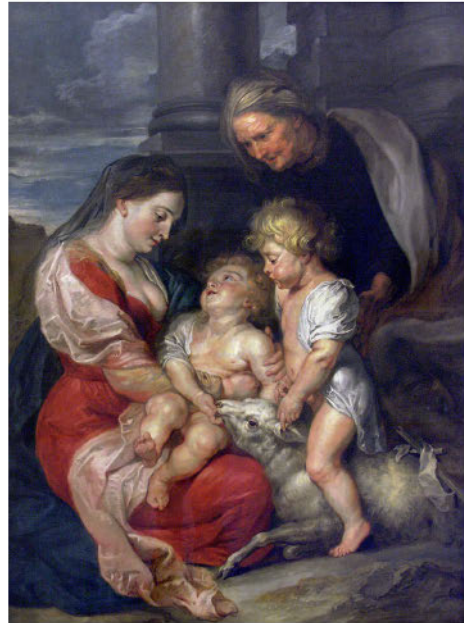
I.23: Peter Paul Rubens, Mary, Jesus, the Baptist (and S. Isabell), ca. 1618. Barcelona, Museum National d'Art de Catalunya .