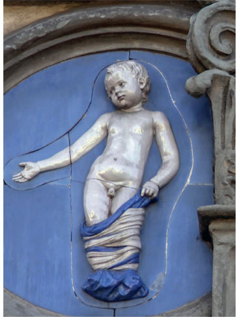
I.4: Hatching from the pupa or cocoon, 18th century (?). Florence, on the facade of the former Ospedale degli Innocenti .