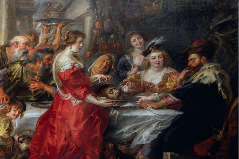
I.21: Peter Paul Rubens, Salome, "Serving" the Head of John the Baptist, after 1635. Edinburgh, National Gallery of Scotland .