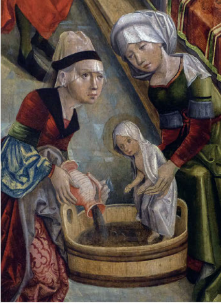
I.17: "Nativity", and Bathing of the Virgin Mary, anonymous, 1510–1520. Budapest, Hungarian National Gallery .