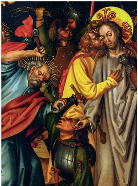
I.14: Jesus, Peter, Malchus, Judas. Reattachment of the (unfortunately left) ear , anonymous, 1502. Augsburg (Germany), Schaezlerpalais .