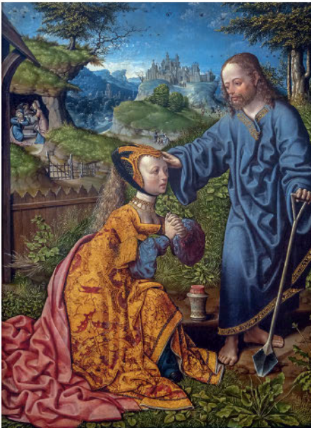
I.36: Jacob C. van Oostanen, Jesus as Gardener and Magdalene, 1507. Kassel (Germany), Wilhelmshöhe Palace .