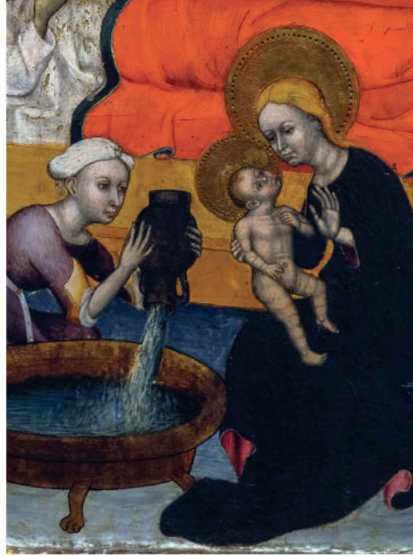
I.18: "Birth", and Bathing of the Baptist, anonymous, 1420–1430. Barcelona, Museu Diocesà .