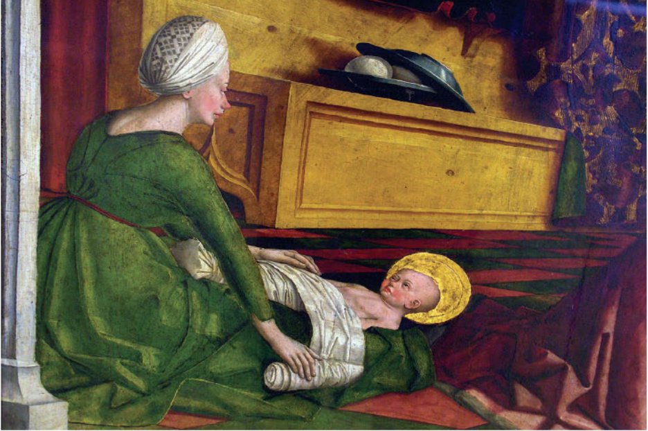
I.6: Master of the Uttenheim Panel, Nativity of the Virgin , ca. 1480. Swaddling with ribbons. Nuremberg, Germanisches Nationalmuseum .