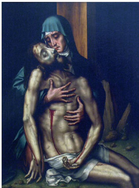
I.9: Luis de Morales, Pietá , ca. 1570. Madrid, Real Academia de Bellas Artes .