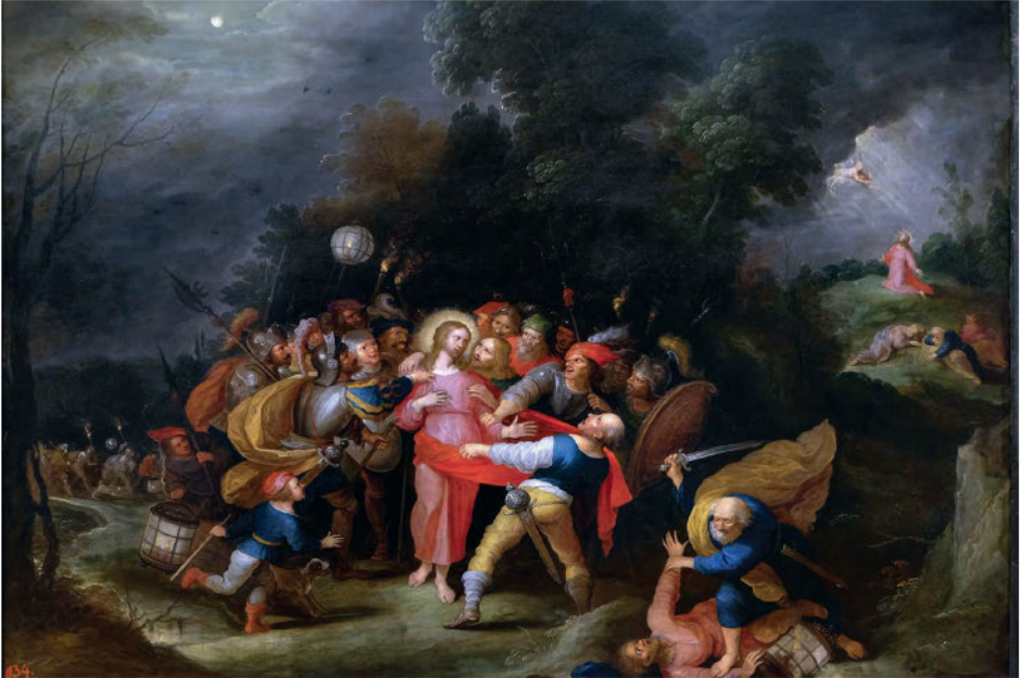
I.1: Frans Francken the Younger, The Arrest of Jesus , 1620–1625. Kassel (Germany), Wilhelmshöhe Palace .