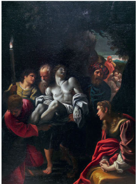
I.37: Sisto Baldaloccio (1585–1619?), Entombment with “Joseph of Arimathea”. Dulwich (near London), Picture Gallery .