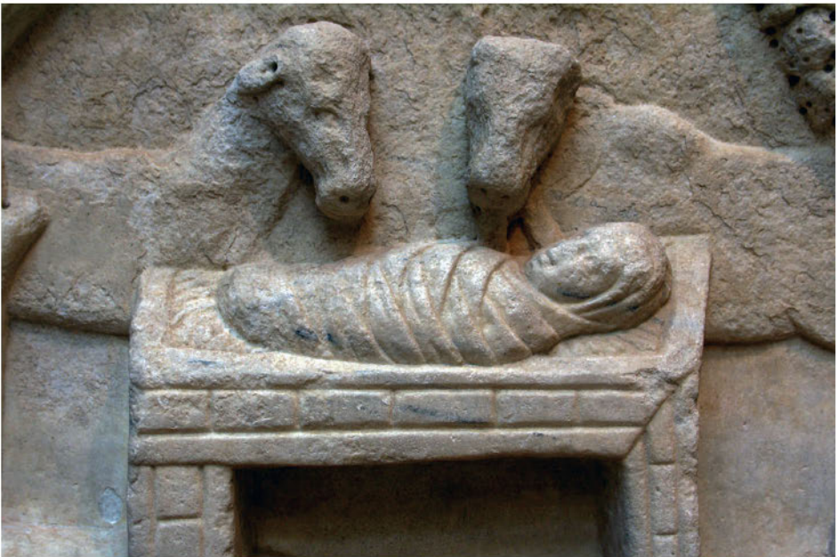
I.5: Nativity, late 4th or early 5th century; Naxos. Athens, Byzantine Museum .