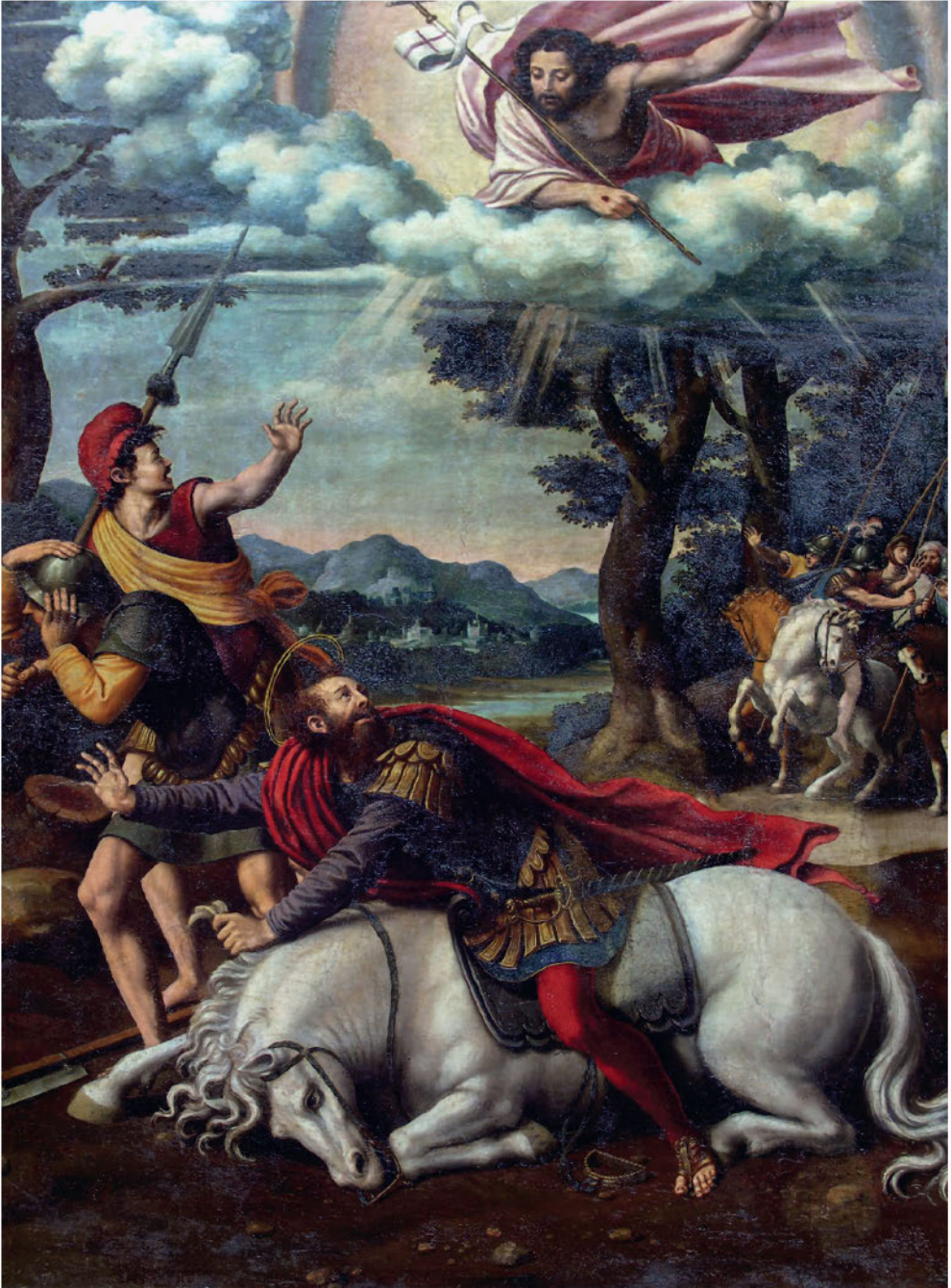
I.8: Vincent Macip, Conversion of the Apostle Paul (with his legendary fall from his horse), 16th century. València (Spain), Cathedral Museum.