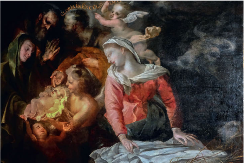
I.7: Josef Ignaz Mildorfer (?), Nativity (with oxen, right) , 1763. Swaddling with ribbons. Bratislava, Esterházy Palace (special exhibition 2016).