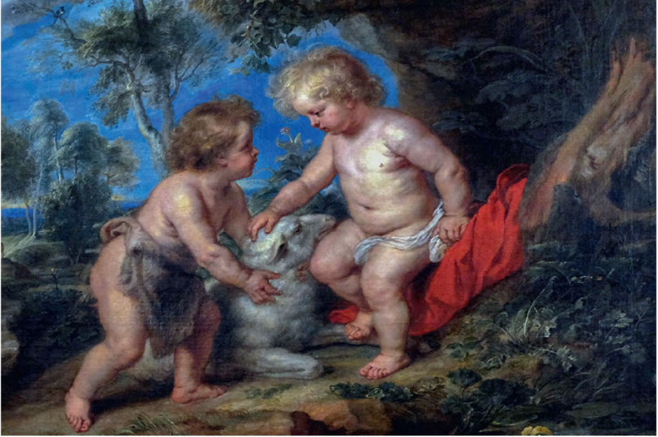
I.24: Peter Paul Rubens (school), Jesus and the Infant John , ca. 1616. Schleissheim (Germany), State Gallery .