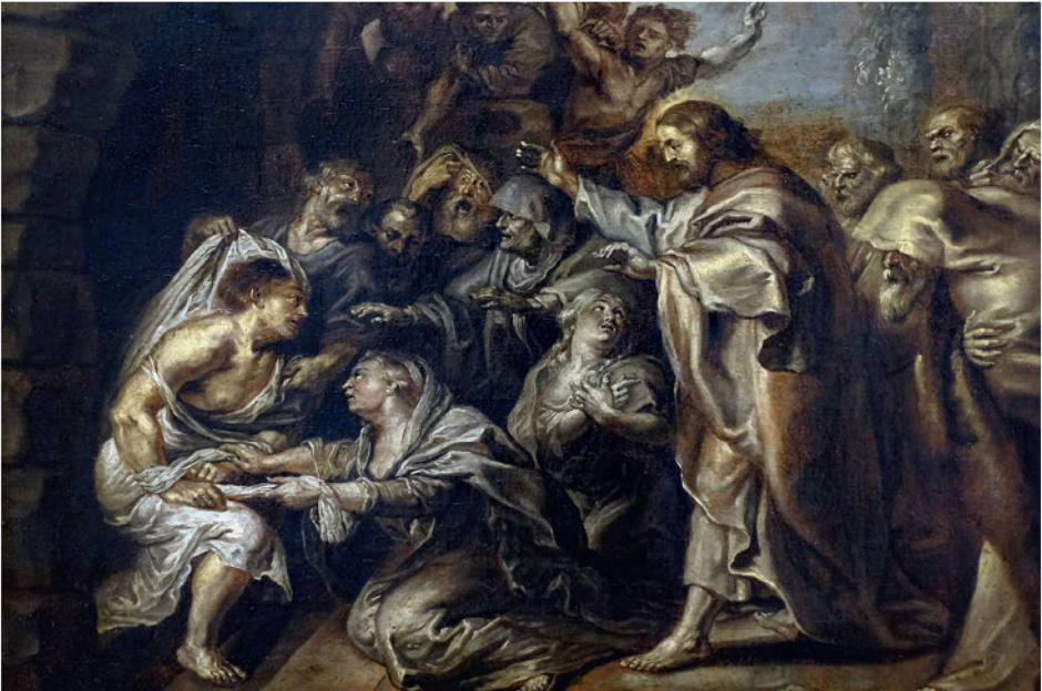
L30: Theodoor van Thulden, The Raising of Lazarus , 1640–1650, after P.P. Rubens. Karlsruhe (Germany), Kunsthalle .