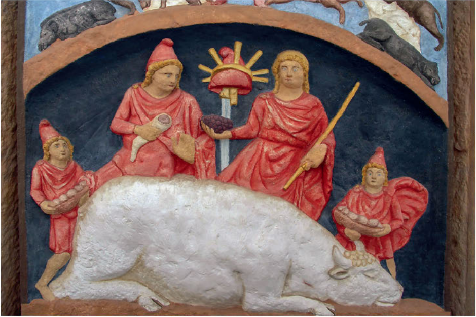
I.32: Mithras and Sol at the celestial cult feast, 3rd century, color-reconstructed cast. Frankfurt, Archaeological Museum .