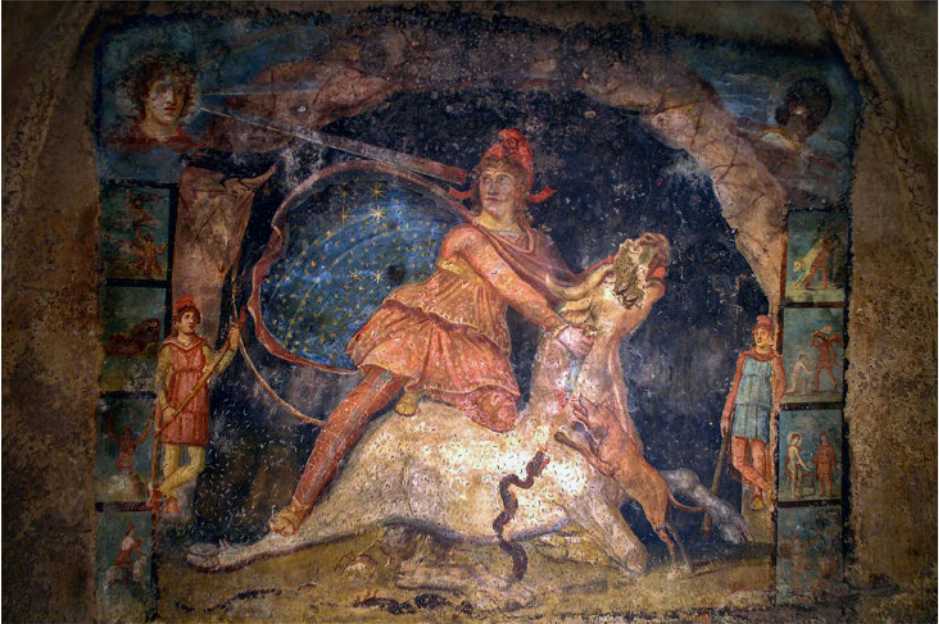
L26: Mithras sacrificing the bull. Polished wax painting, in situ, late 2nd century. Marino Laziale, Alban Hills south of Rome.