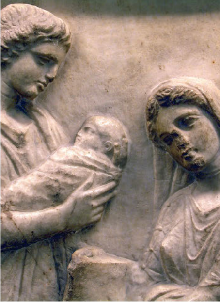
I.3: Parents with a tightly swaddled child, looking like a chrysalis or big insect cocoon; Athens, tombstone, 425–400 BC. London, British Museum .