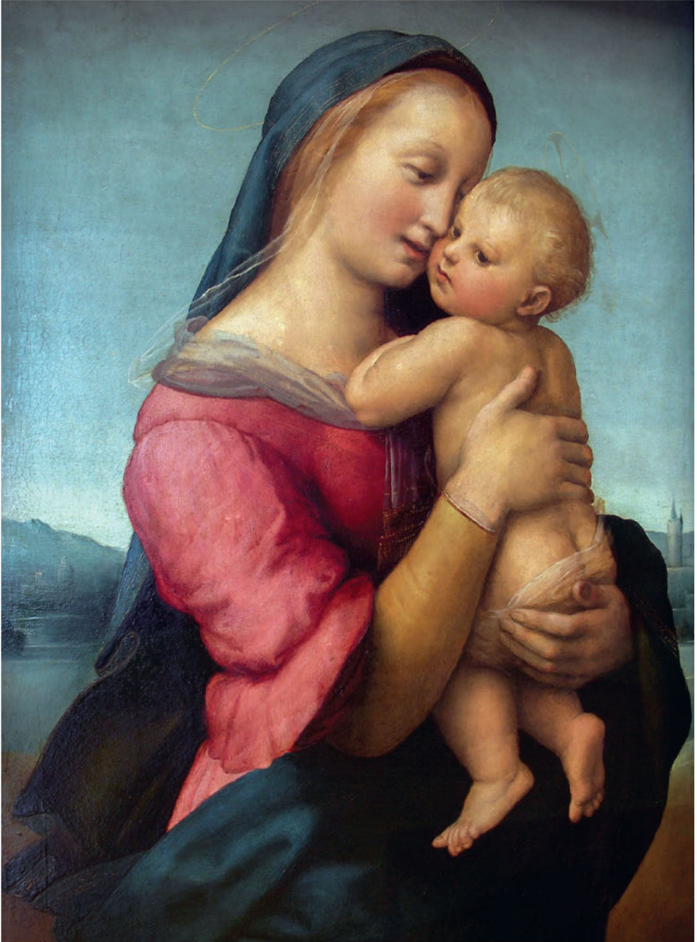
L16: Raphael, Madonna Tempi , 1508. Munich, Alte Pinakothek .