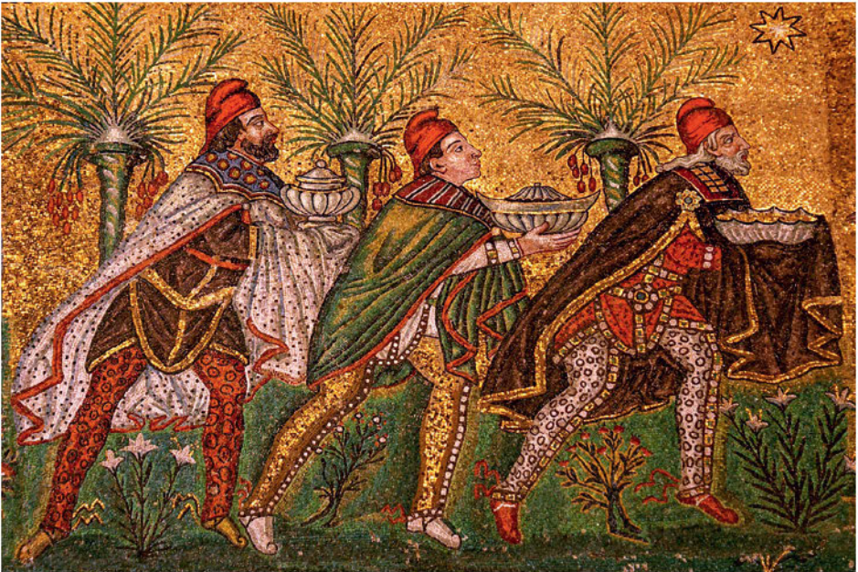
L27: The Magi (Three Wise Men) in Parthian-Sassanian aristocratic dress, with “Phrygian” caps and braided trousers. Mosaic, 5th/6th century. Ravenna (Italy), Sant’ Apollinare Nuovo .