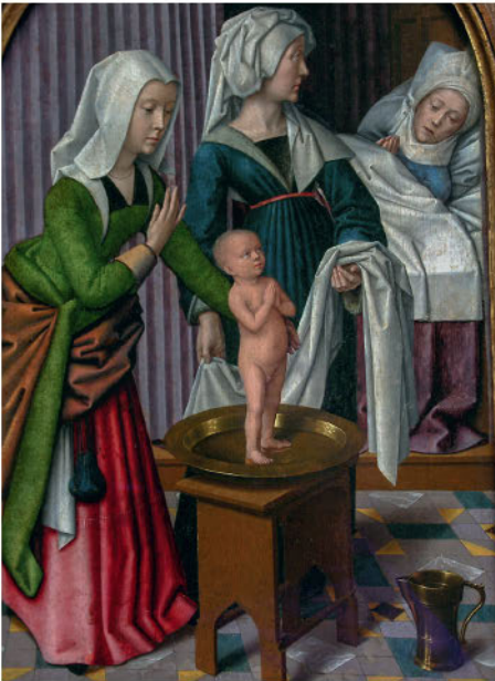
I.19: Gerard David, Bath of St. Nicholas, after 1500. Edinburgh, National Gallery of Scotland .