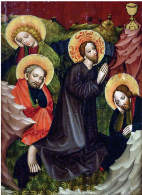
I.13: Jesus and Sleeping Disciples , anonymous, ca. 1450. Budapest, Hungarian National Gallery .