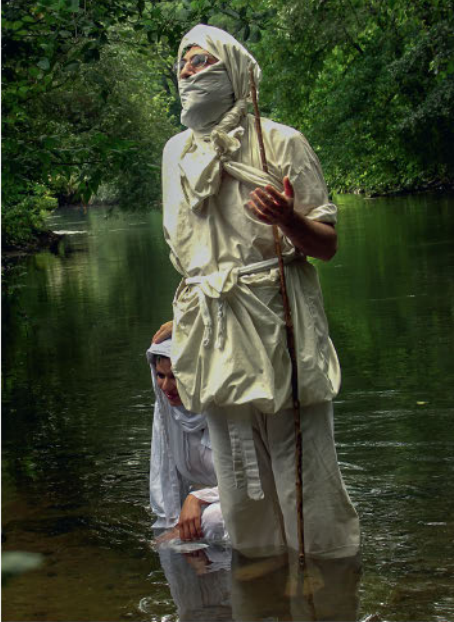
L28: Mandaean baptism in the Pegnitz (Germany), 2009. The priest and one of the brides in pure white; he with turban, belt, and baptizer crook.