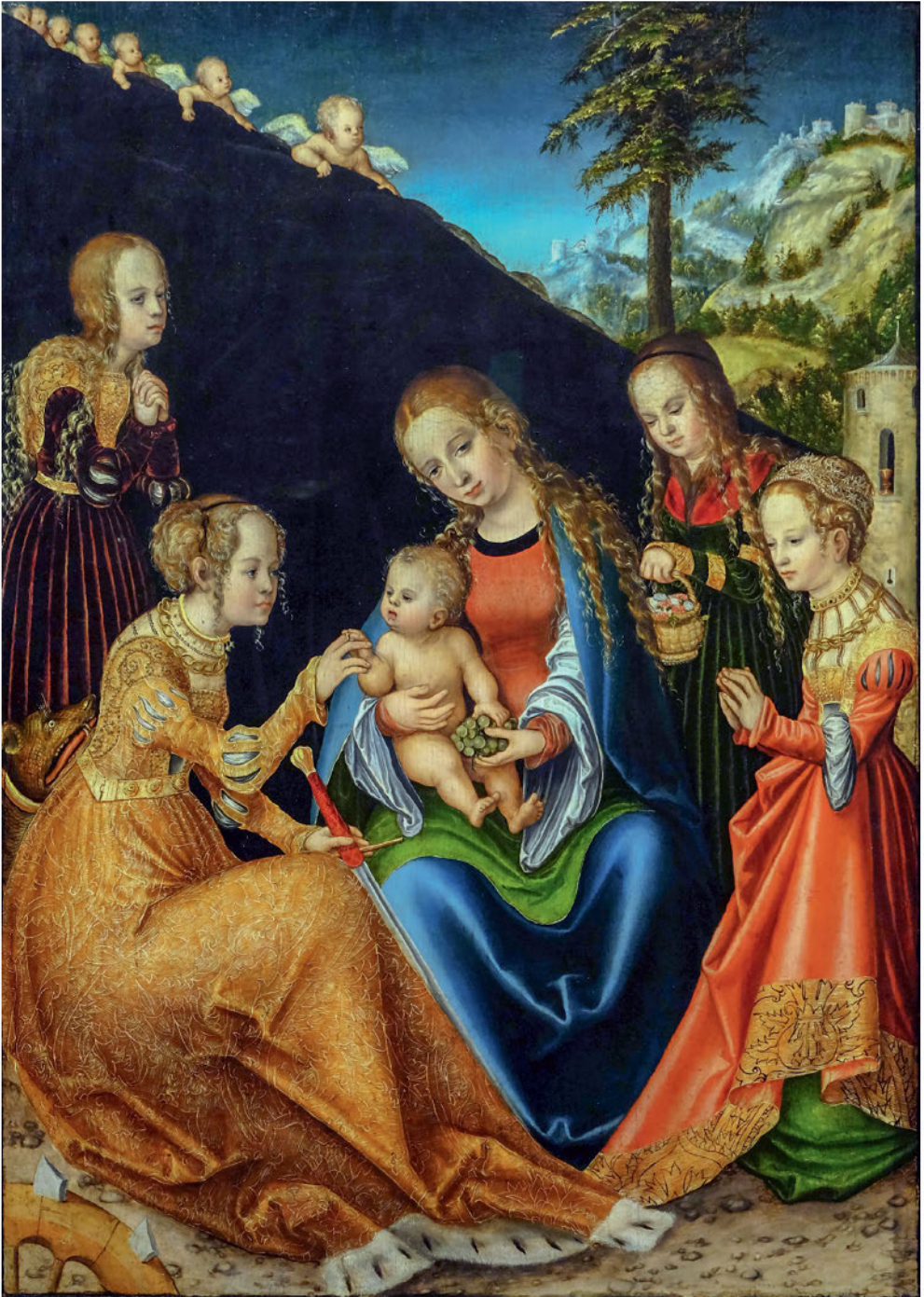
I.31: Lucas Cranach the Elder, "The Mystical Marriage of St. Catherine", ca. 1516. Budapest, Szépüvészeti Museum .