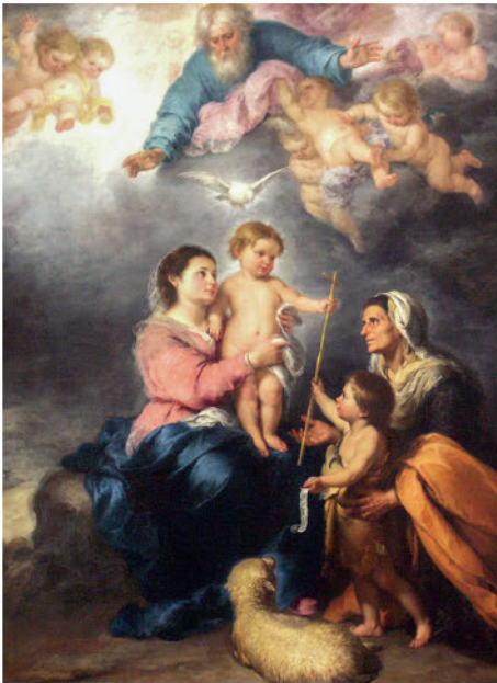
I.22: Bartolomé E. Murillo, Holy Family, ca. 1665. Paris, Louvre .