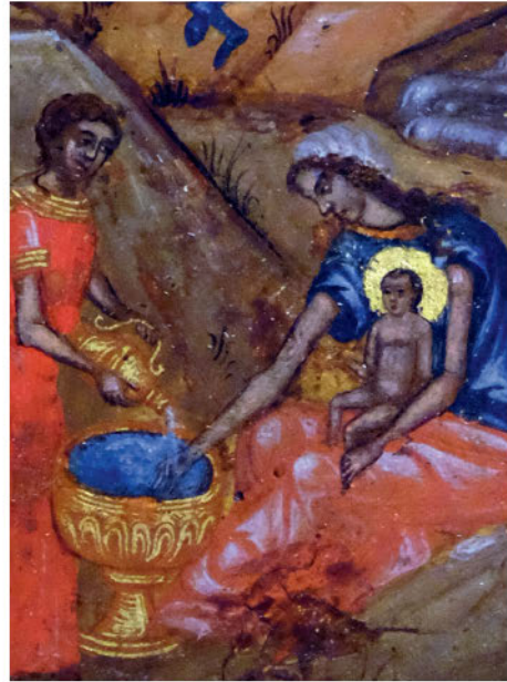
I.20: "Nativity", and Bathing of the Christ Child (Greek Orthodox), 18th century. Crete, Toplou Monastery .