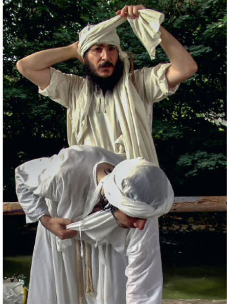
L29: The priest puts on his headband, still on the shore. The bridegroom and baptizand before him stokes the rite fire.