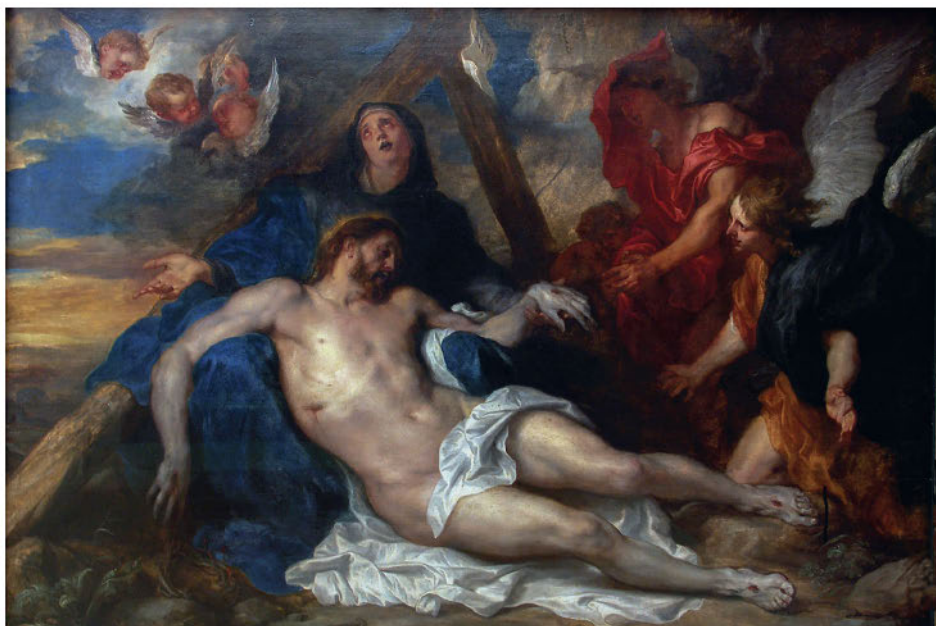
I.11: Anthony van Dyck (1599–1647), Lamentation . Munich, Alte Pinakothek .