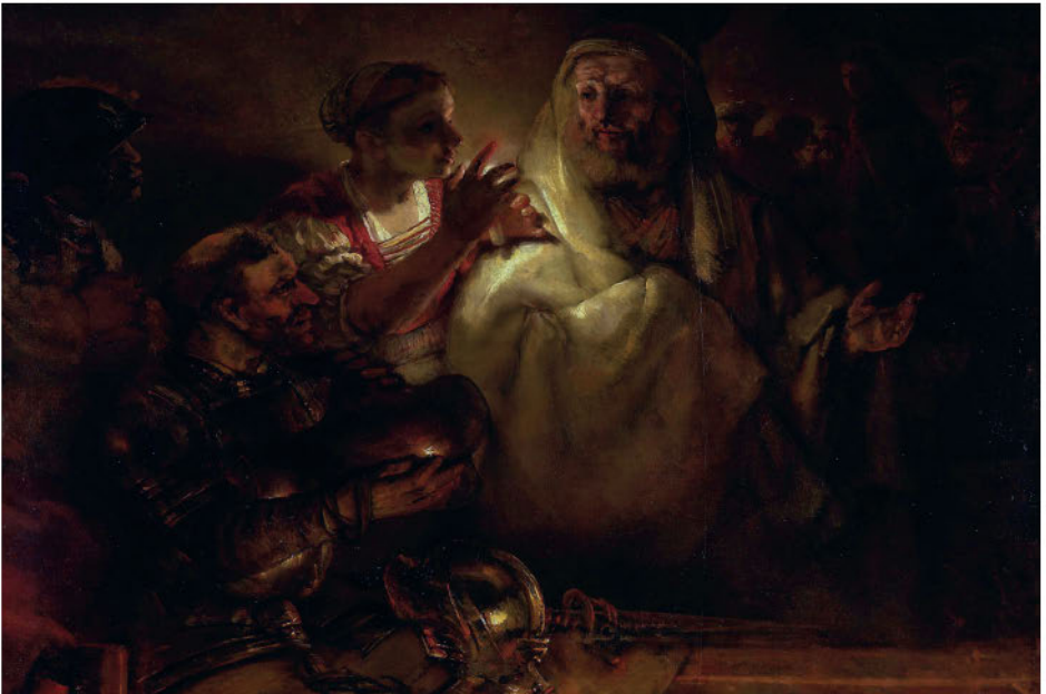
I.2: Rembrandt van Rijn, Peter by the Fire , 1660. Amsterdam, Reijksmuseum .