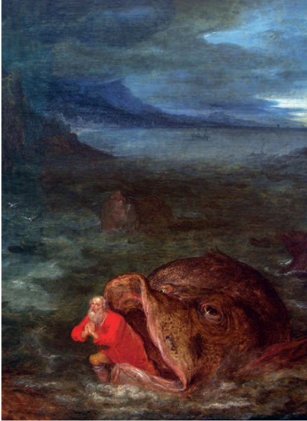
I.34: Jan Brueghel the Elder (1568–1625), “Jonah rises from the whale”. Munich, Alte Pinakothek .