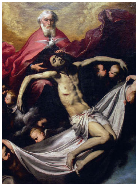
I.10: José de Ribera, Trinidad , 1635. Madrid, Prado .