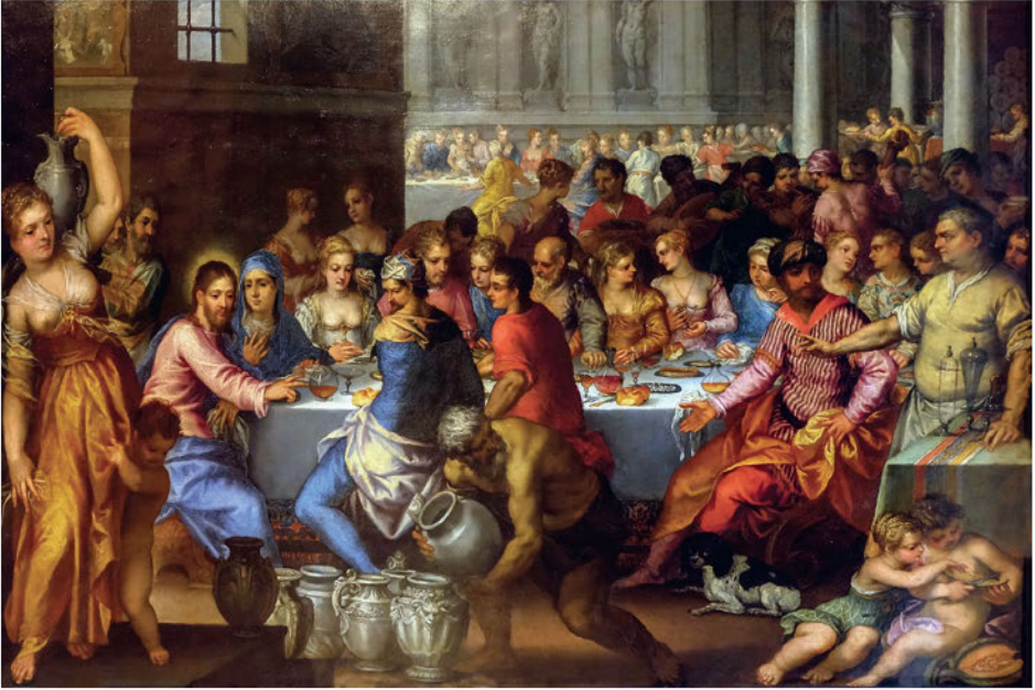
I.12: Johann Rottenhammer (1564–1625), Wedding at Kana . Augsburg (Germany), Schaezlerpalais .